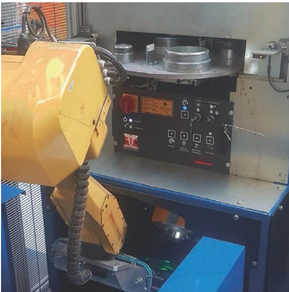
Image 2 > At AAM Lyon every produced torsional vibration damper is measured with the coatmaster. The layer thickness and other production parameters are lasered as a QR code.

of the devices. "It's also possible to measure coating thickness from a distance with high tolerances on distance and angle, which greatly facilitates the integration of the coatmaster into a production line. "